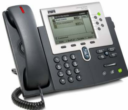
Figure 1. Cisco Unified IP Phone 7961G-GE

Providing unconstrained bandwidth to desktop applications, the Cisco Unified IP Phone 7961G-GE delivers the latest technology and advancements in Gigabit Ethernet voice-over-IP (VoIP) telephony, bringing network data and applications to users quickly with its Gigabit Ethernet port for integration with a PC or desktop server (Figure 1). “Feature identical” to the Cisco Unified IP Phone 7961G, this Gigabit Ethernet enhanced manager IP phone provides six programmable backlit line/feature buttons and four interactive soft keys that guide an executive or manager-type user through call features and functions, and audio controls for high-quality duplex speakerphone, handset, and headset. The Cisco Unified IP Phone 7961G-GE features a best-of-class large, higher-resolution, grayscale pixel-based LCD for easy access to communication information, timesaving applications, and feature usage (Figure 2). It also helps customers and developers deliver more innovative and productivity-enhancing Extensible Markup Language (XML) applications and can provide double-byte languages to the display.